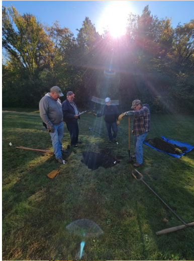
Fall Clean-up 2024